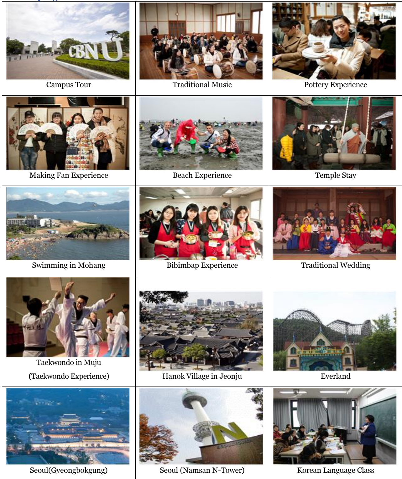
Photo of program