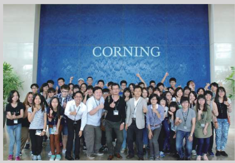
Business site visit to Corning Taiwan