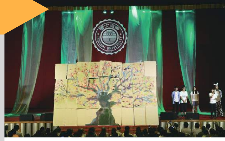
2015 Tunghai Freshmen Night Highlight - Freshmen paintings combine into a tree.