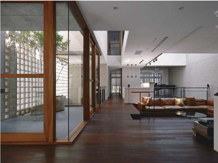
Architect Chieh-Erh Huang and Tung-Nan Tsai “Chang’s House in Yilan” emphasizing on the light at atrium area