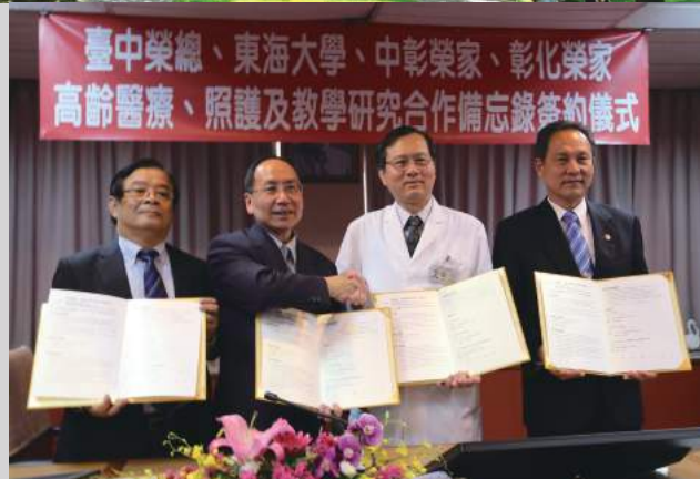
THU, TVGH, Chung-Chang Veterans' Home and Changhua Veterans' Home signed the Memorandum of Understanding for senior citizen healthcare