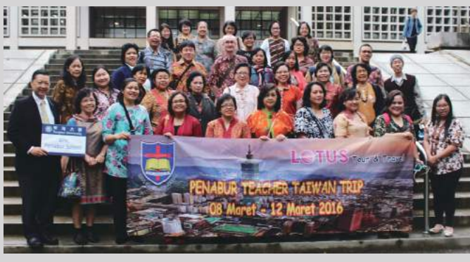
BPK members visit the main library of THU