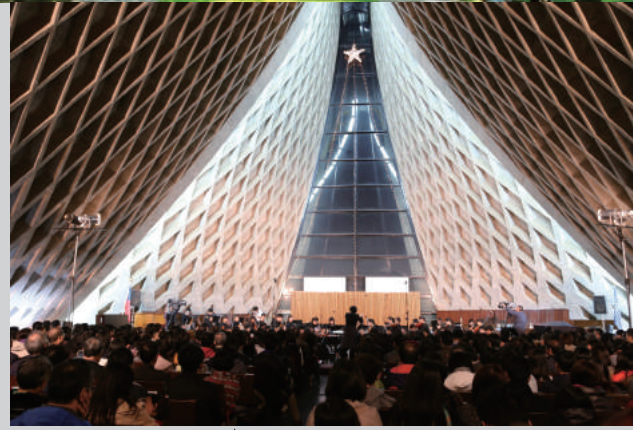
Christmas concert inside and outside of the Luce Chapel

Two local companies which were also classical music fans, Avertronics Inc. and Lai Jang-Liang Architect Office, sponsored the live outdoor broadcast. Performances in the Luce Memorial Chapel were projected simultaneously on its outer glazed tile surface, providing a spectacular visual and audio experience to the audience. The magnificent musical feast was also webcasted synchronously to the Tunghai alumni worldwide.