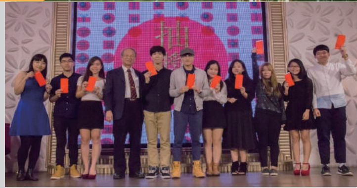
International students win red envelope during the lucky draw session

Excellent performances presented by the international student association, Chinese student association and overseas Chinese student association made an enjoyable evening to all the participants. There were cheering and applauses throughout the evening. The event created a happy beginning of the year 2016 as well as a festive anticipation for the upcoming Chinese New Year holidays.