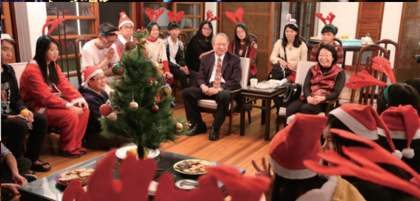
← THU students caroling at President's house