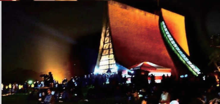
People Gathered in front of the Luce Chapel to watch the performance →