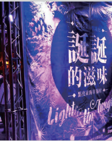
↑ Main theme of Tunghai Christmas celebration : Light Up Tunghai