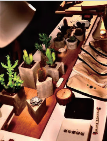
← Students from Dept. of Industrial Design sold their own-designed products at Christmas market