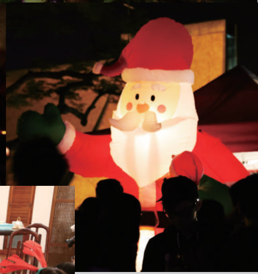
↑ Christmas Decoration on Campus